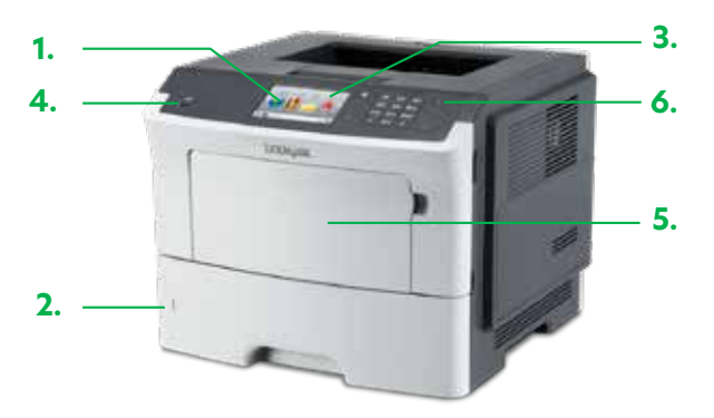
M3150 with 4.3-inch color touch screen