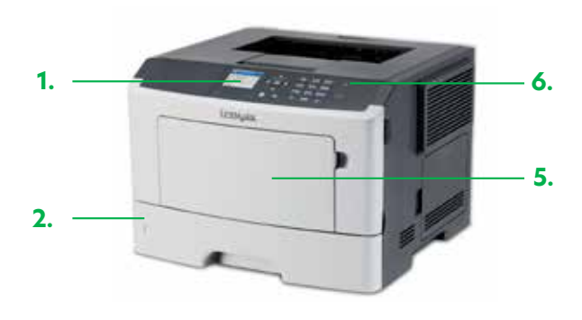
M1145 with 2.4-inch LCD screen