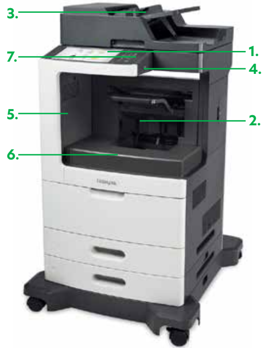
XM7170 model configured with Staple, Hole Punch Finisher

Choose from multiple output options, including a four-bin mailbox, an offset stacker, a staple finisher and a staple with hole punch finisher.